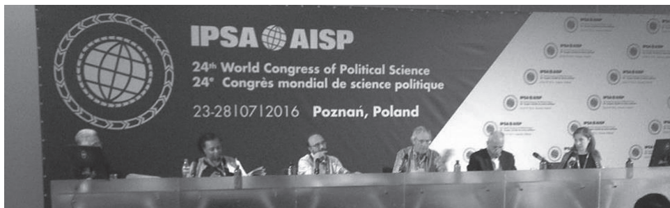
Photo: Participants of the round table of the state of modern democracies

The city of Poznań (Poland) and the Faculty of Political Science and Journalism of Adam Mickiewicz University hosted the 24th Congress of International Political Science Association (IPSA), July 23–28, 2016. The goal of the conference, entitled Politics in a World of Inequality was to gather scholars and practitioners from different countries to discuss the complexity of inequality approaches. This was done, for instance, in connection to a need