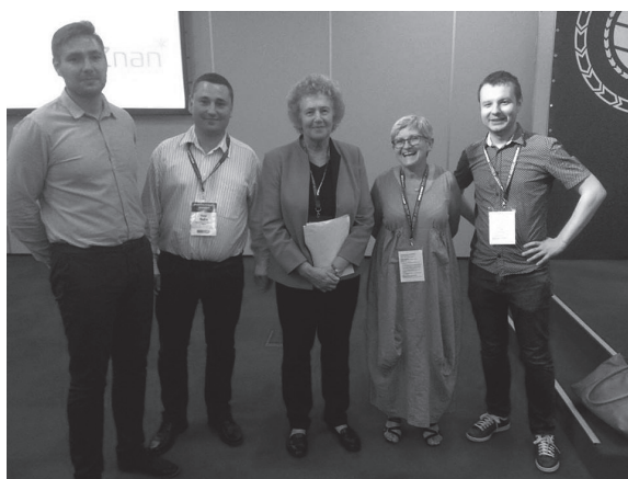
Photo: Professor Pippa Norris with the IPSA Congress participants from the University of Wrocław

The city of Poznań (Poland) and the Faculty of Political Science and Journalism of Adam Mickiewicz University hosted the 24th Congress of International Political Science Association (IPSA), July 23–28, 2016. The goal of the conference, entitled Politics in a World of Inequality was to gather scholars and practitioners from different countries to discuss the complexity of inequality approaches. This was done, for instance, in connection to a need